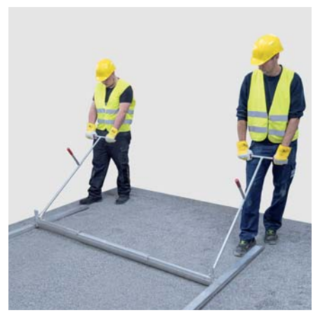
TP-150/260 with HG-ERGO-DUO