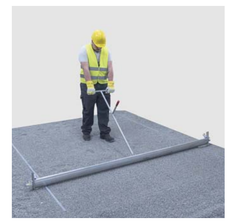
FP-250 with HG-ERGO-SOLO