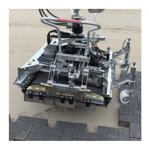
HVZ-UNI-II-EK with HVZ-FA-RE