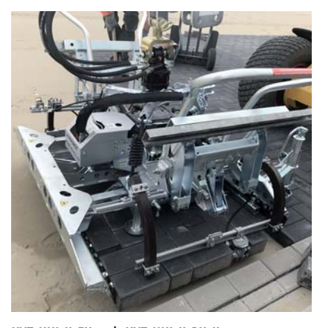
HVZ-UNI-II-EK with HVZ-UNI-II-PK-II