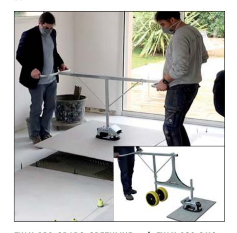
FXAH-120-GRABO-GREENLINE with FXAH-120-DUO-Set, bottom right: additionally with wheel set VPH-RS